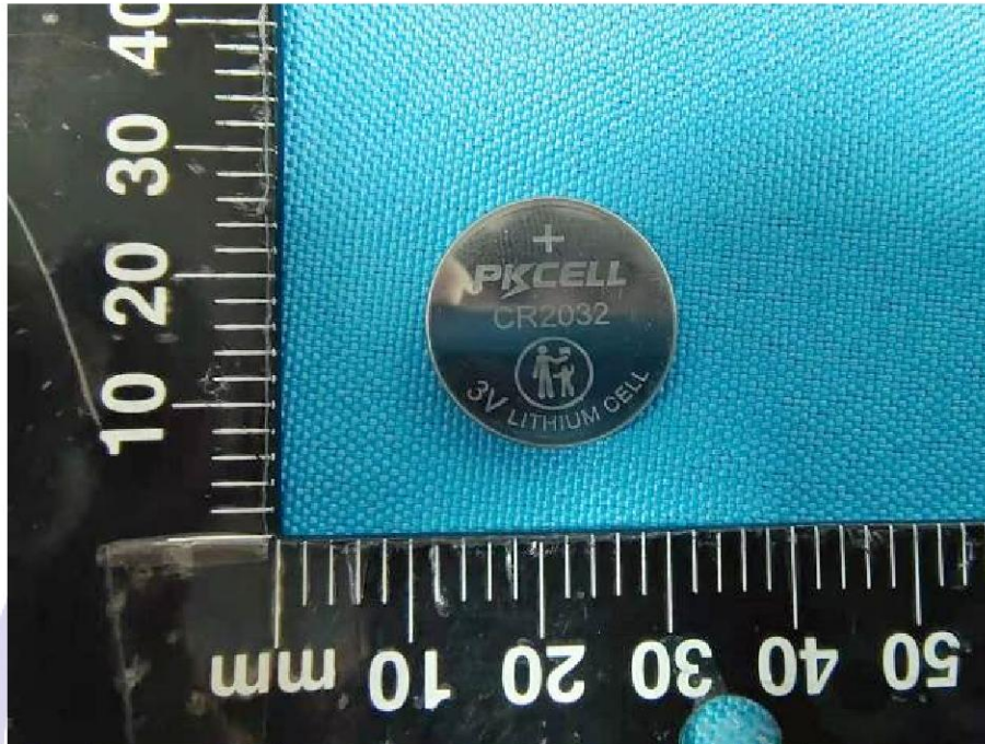
Photo 1 Front 正面